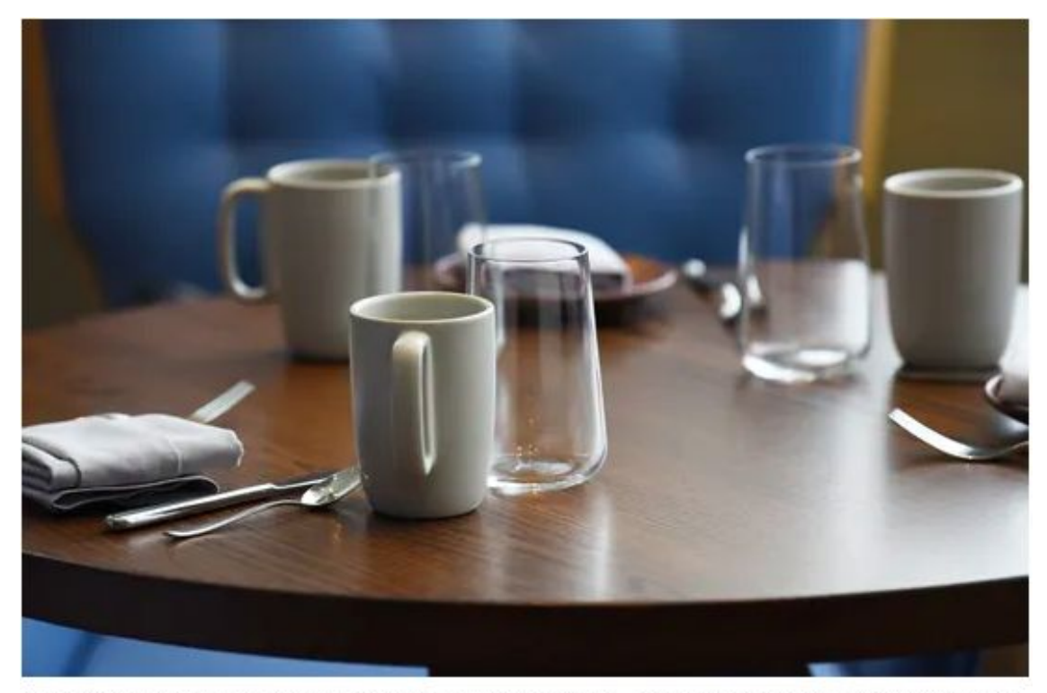
A set table in the lounge at MC Hotel in Montclair on 08/14/19.

Dolce Federica: This Montclair shop creates small-batch, hand-made, artisanal European chocolate. Chocolatier Federica Heiman, who lives in Montclair, made two special chocolate bars specifically for the hotel: Frutti di Bosco with dried raspberries and blueberries and Noci Miste with toasted almonds, pecans and Italian hazelnuts. Both are made with French dark chocolate. Find the chocolate in The Marketplace and in-room minibars.